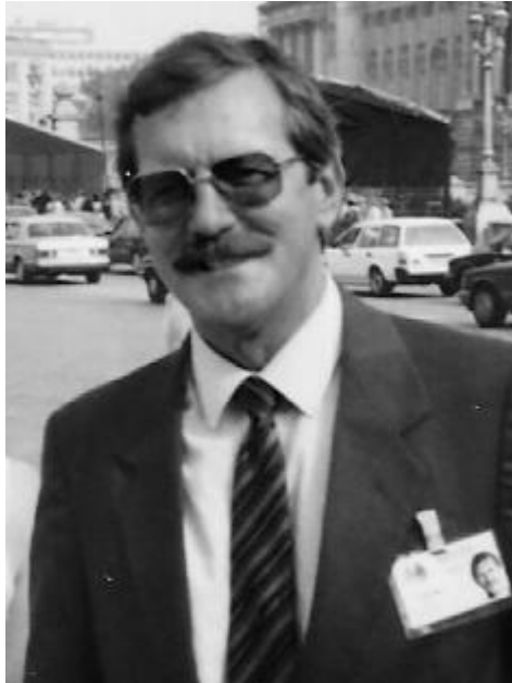
Clive Derby-Lewis (1936-2016)