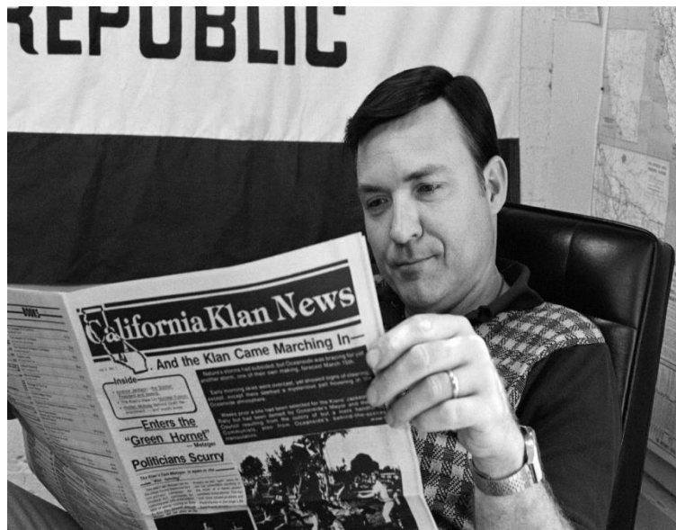
Tom Metzger (1938-2020)